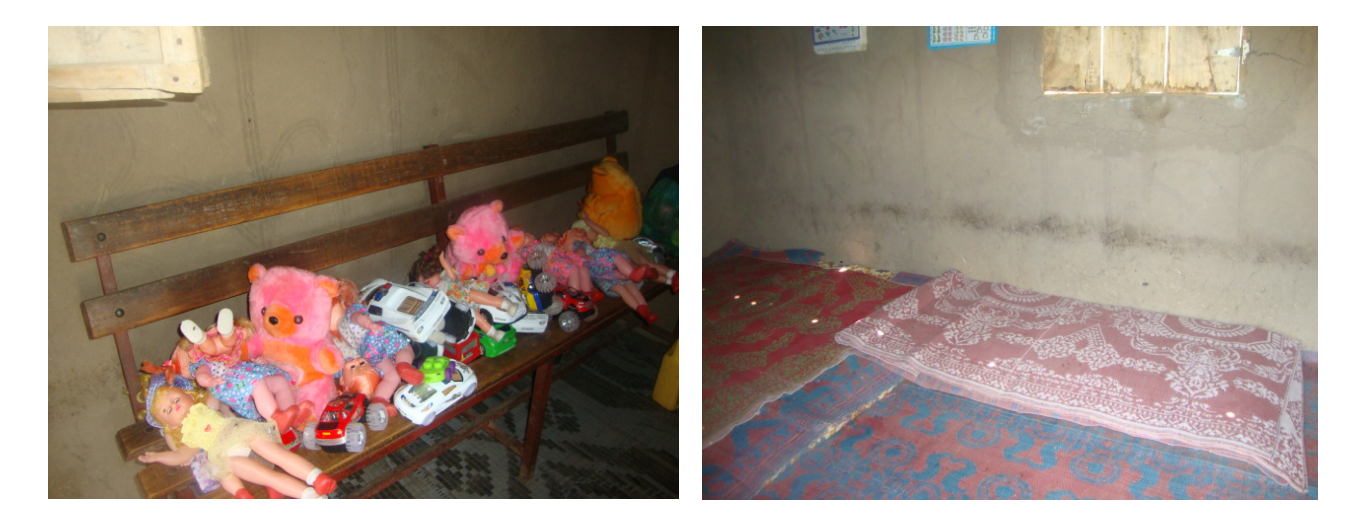
Children's toys and play room at the ECD Center

The VCC vice-chair also said: "now we are not scared of the situation after because we are prepared for it. Through our idir , we already started contributing birr 2 every month for OVC. We put this money in the bank. We now have about birr 5000".