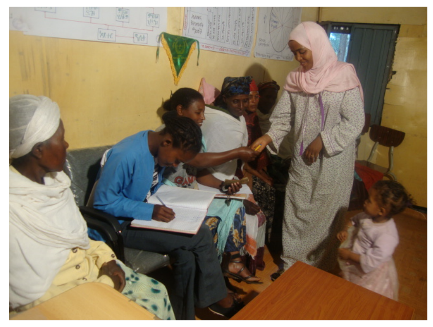
SHG members during the weekly contribution

The documenting team also held focus group discussion with a self help group at Gulele sub city, Addis Ababa. Members are from destitute households and parents/guardians of OVC. They came as a group following a training session organized by the project. Motivated by an idea from a community caregiver, training participants agreed to allot part of their per diem as a startup for a self help group. Then they decided to contribute 2 birr per week realizing a saving scheme they learnt during the training. Now the group has a revolving fund of its own, where members take loan from, and do their petty trade.