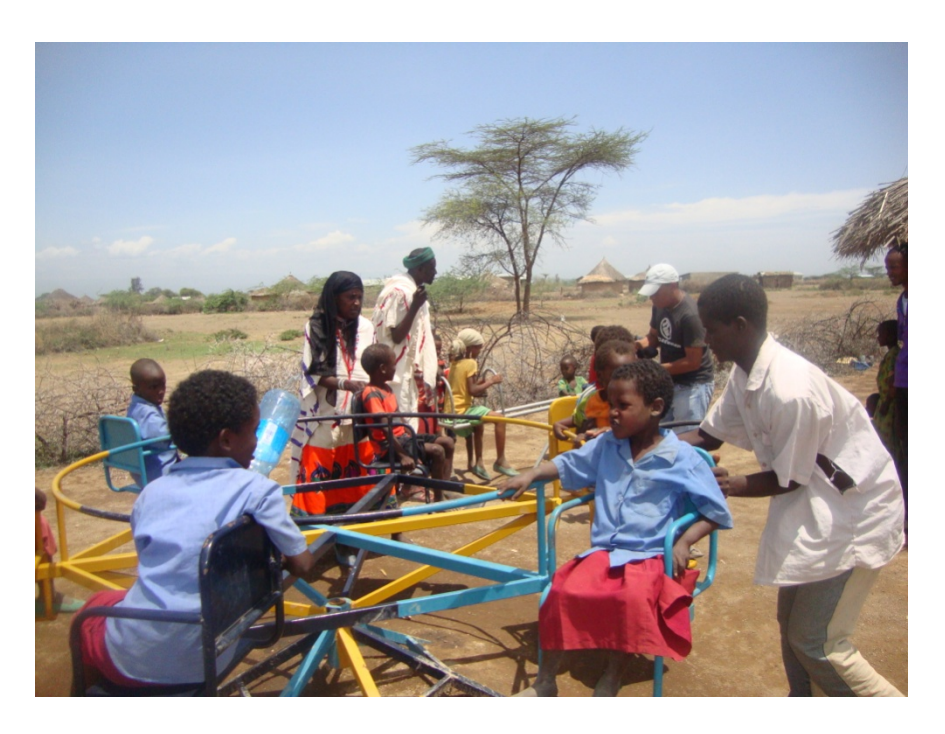
Children playing at Dire Ad ECD Center, Fentale

At Gelcha kebele there are 3 ECD centres built at about the same time with community initiatives and support from the SCSN project. A total of 153 children spend their time in the ECD centers. Each has a classroom, a feeding room and a playground.