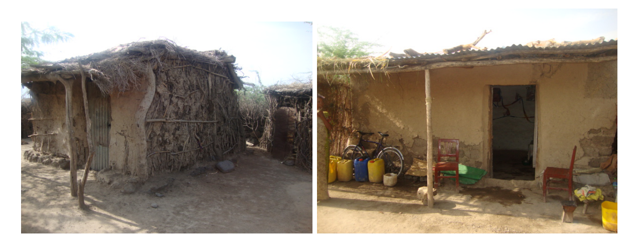
The old dilapidated house

children in the SCSN project support. Abay also became instrumental in building a better house for the poor lady mobilizing community volunteers with the SCSN project office at Metehara. She also assisted the lady in accessing startup capital to initiate an income of her own. The lady bought a cow and she got a calf. She sells milk and supports her income.