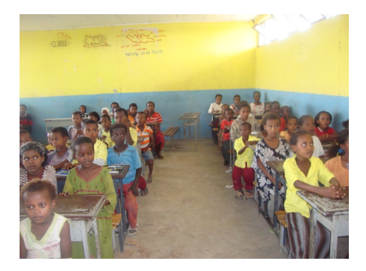
Children attending tutorial class at Alge, Fentale

Basically we help the kids on subjects in which they are less performing. However, we also share them the knowledge we got from the life skills training. We advise them to be respectful to their parents and elders, and be attentive in their education. As a youth mentor I feel that I should be a role model to the children. I have to be truthful and honest. I think, youth mentorship helped me to develop such behavior in me and others. The best experience I observed in the exercise is my improved ability to speak my mind unashamed and with audacity in front of an audience. I also feel that I now have the capacity to distinguish my strength and weakness. I am trying to impart such capacity among the children that I help. In fact, the alert and active participation of some children amazes me, and it encourages me too.