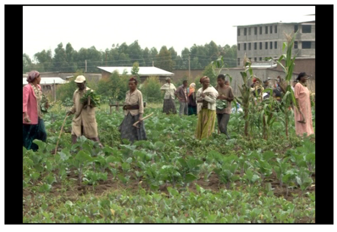
SHG members attending their garden, Shashemene

treasurer of one organized group. So far we have contributed birr 940. We did not yet open a bank account, in due course we will. Our plan is to take some loan to start a small business". Focus group participants also said that they planted pepper, cabbage and spinach. They divided the first harvest among themselves on purchasing arrangement. "We bought our produce purposely to augment our savings".