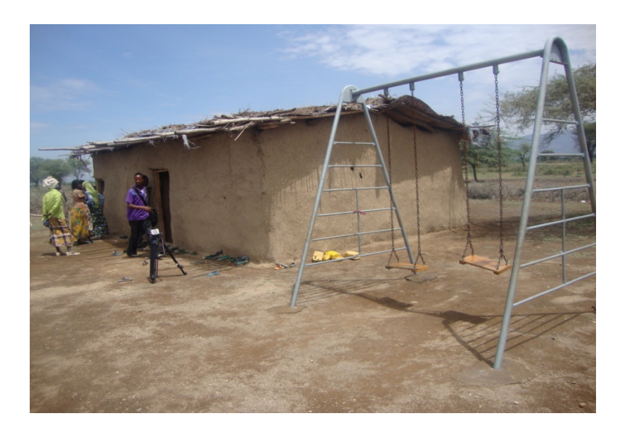
The ECD center at Dire Redi, Fentale woreda

The ECD center at Dire Redi is found in a rural kebele called Gelcha after 20 or 25 minutes drive on a bumpy road from Metehara. It was built in 2010 by the community with some help from the ChildFund/the Association in terms of cooking utensils, wire, nail, toys, other play things, mattresses, etc. A total of 61 children (32 female) spend their time in the center.