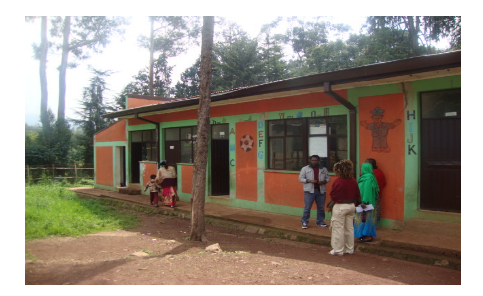
Woreda 06 ECD Center, Gulele, Addis Ababa

Education Office over the issue. She, together with the other members of the VCC, persevered and finally became successful on both prongs.