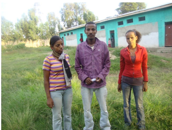
mentors at Shashemene

The youth mentors told us that they started tutorial and mentorship in July 2010 after eight days training on life skills and teaching methods. They also took lessons from experienced teachers who occasionally observed the tutorial process. The children attend tutorial classes for an hour 3 days a week; from Monday to Wednesday, from 5:00pm to 6:00pm; and on Saturdays for 3 hours from 9:00am to 12:00am.