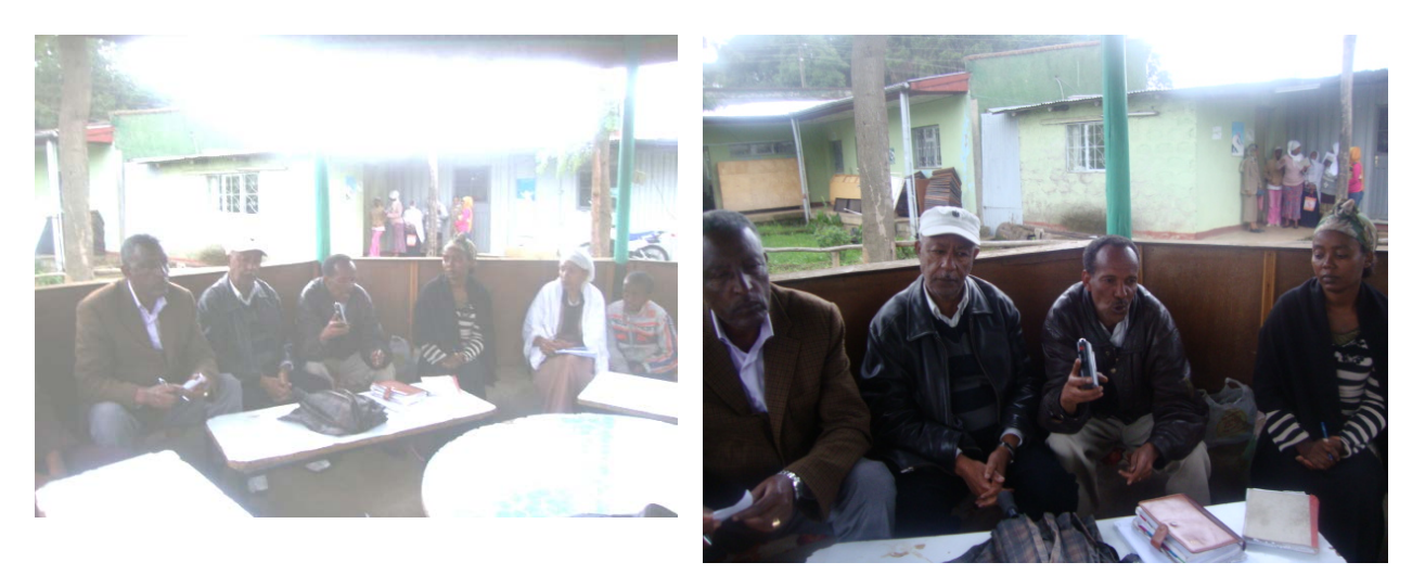
FGD participants of VCC members, Kebele 06, Gulele, Addis Ababa

A total of thirteen VCC had participated in the FGD sessions of which two were females. Most of the committee members started to serve when the project was launched three years ago though few started a year ago. The committee has a chair person, a secretary, a paralegal member and a child representing vulnerable children. VCC members claimed that they were voluntarily recruited by the people based on their previous deeds and commitment they had in their community. Some discussants have reported that they were also serving the people in the form leading "Iddir" prior to their involvement in the VCC. The child representative said, "Children believe that I can represent them in the committee and selected me".